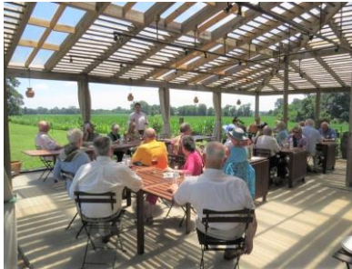
Beautiful day for a meeting at the Hague Winery

There being no further business, the meeting adjourned at 1400.