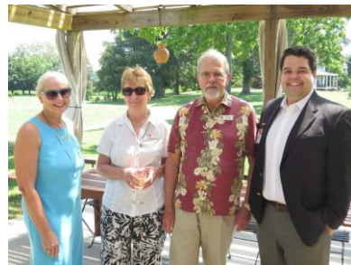
Guys and dolls