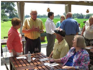
Lots of good discussions