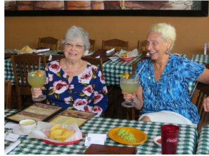
Ladies with their petite libations