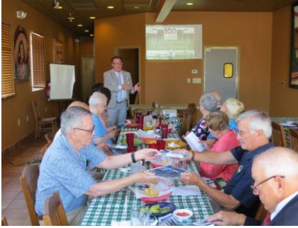
Hmmm – food or speaker?

There being no further business, the meeting adjourned at 1335.