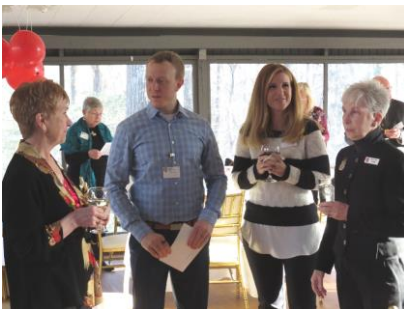
Guests enjoying the meeting and they can sign up!